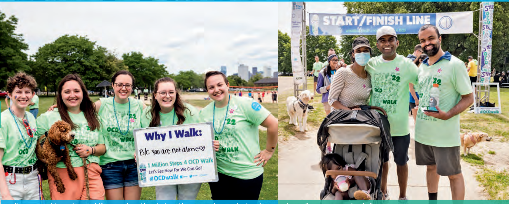
Walkers were able to choose different colored beaded necklaces to indicate whether they The Walk attracts people of all ages! were Overcoming OCD, Support Squad, or a Proud Provider — or all three!