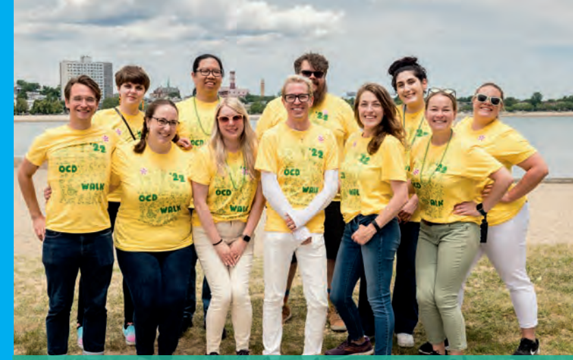
IOCDF staff pose for a photo after running a very successful event at the Boston Walk.

The One Million Steps for OCD Walk — now in its TENTH year! — returned with over 35 inperson events and countless grassroots Community Walks taking place across the country. We look forward to walking again with you next year and the continued growth of this amazing, community building and fundraising event.